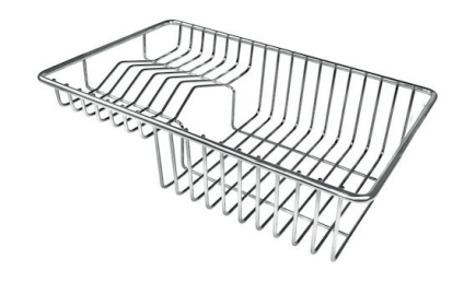
Stainless steel plate rack 8100 303 * only in combination with the accessory 8644 101