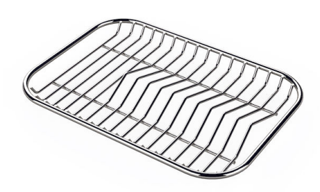
Stainless steel plate rack only usable in combination with the accessories 8644 003