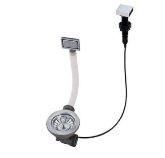
Automatic waste fitting - PM 8407 113